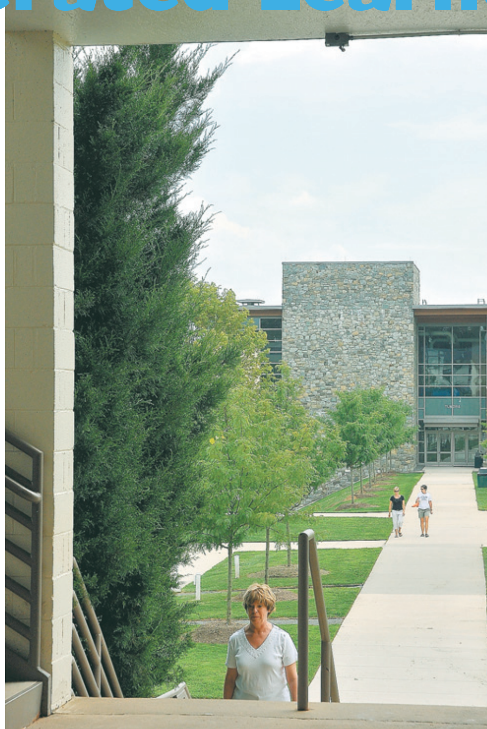
The Potomac School in McLean.